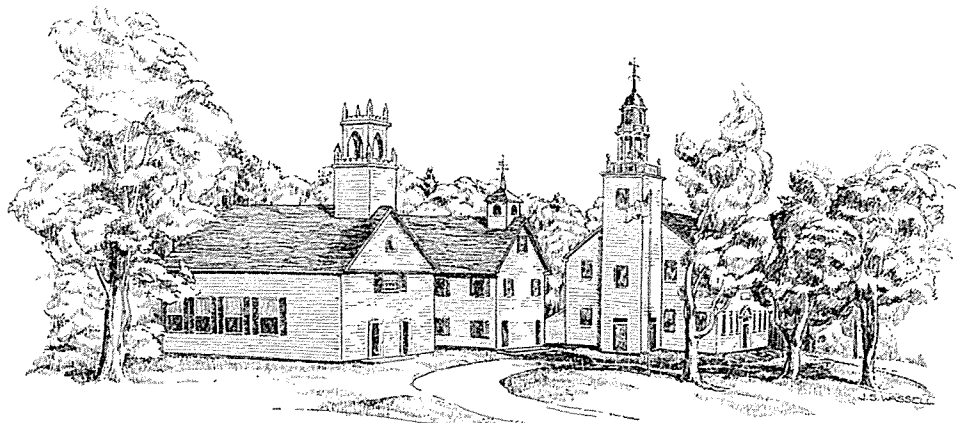
Washington, New Hampshire